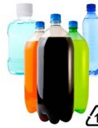
PET #1 Bottles