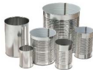
Steel Food & Beverage Containers