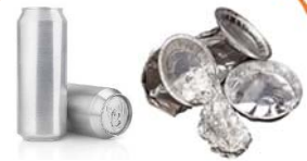
Aluminum (foil) Food & Beverage Containers