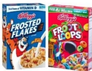
Boxboard (Cereal Boxes)