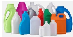
HDPE #2 Color Plastic Containers