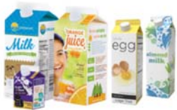
Gable Top Containers