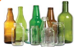
Glass Food & Beverage Containers