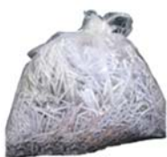
Shredded paper (bagged)

Any soft plastics (bags, food wrappers) should be bagged up together and not placed loose in the blue cart.