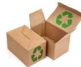
Residential Corrugated Cardboard