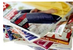
Magazines & Catalogues