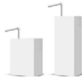
Aseptic Containers (Juice Boxes)